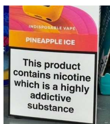
Example of vape label

If you require further assistance or information on tobacco, vapes etc. please contact us or visit the business companion website . Alternatively, please see guidance on the GOV.UK website. You can check products are registered here ECIG Dynamic Search | MHRA