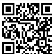
Search registered vapes

PLEASE NOTE that only the Courts can interpret statutory legislation with authority and this leaflet is subject to revision or amendment without notice. (Ref: E-cigs 1.6 – June 2025)