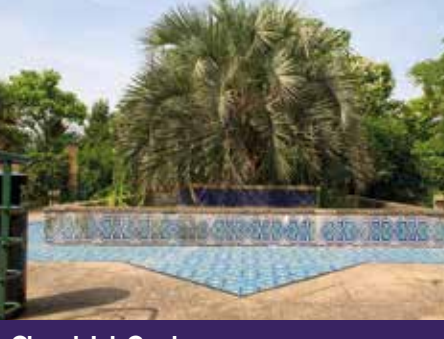
Chumleigh Gardens

and horticultural excellence and even barbecues.