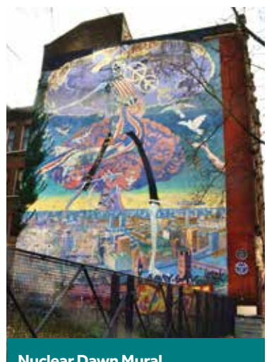
Nuclear Dawn Mural, Coldharbour Lane, Brixton, photograph by Ishwar Maharaj

The mural holds a lot of detail, and it's worth getting up close if you can. There's even a mini version of this mural depicted amongst other landmarks of Brixton, political figures and images of peace.