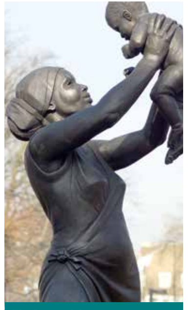
The Bronze Woman

The final building on Cormont Road is the smaller mansion block Dover House , named after the English town that gave sanctuary to the Minet family in the 1680s.