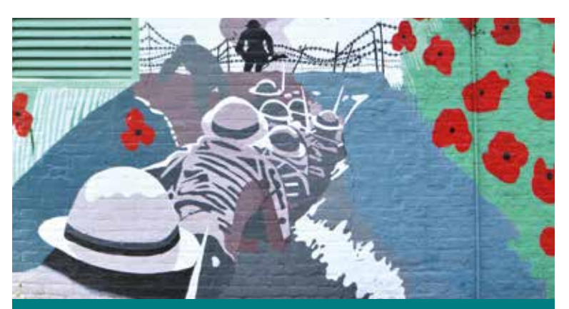
Rotunda Mural