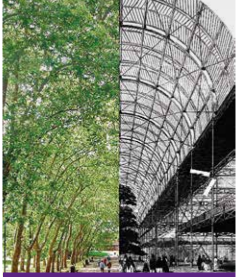
Crystal Palace , illustration by Geles Tomas

Sydenham Wells Park The name of this park refers to 12 natural springs, which were discovered in the 1600s. Their supposed medicinal properties drew large crowds to the area up until the 1830s, including George III. Eventually they became polluted as the area turned into a wealthy suburb, although some are still active.