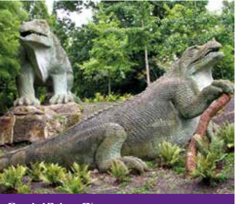
Crystal Palace Dinosaurs