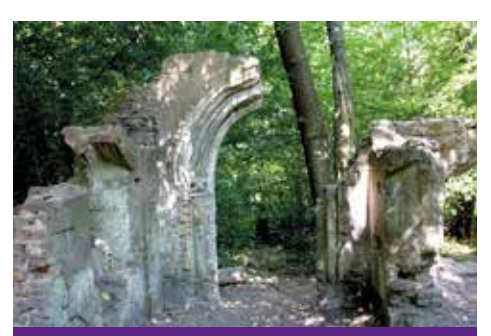
Folly in Syndenham Hill Woods

These creatures are relics of a bygone age and not just the Mesozoic. They are the only remaining attraction of the original Crystal Palace, and were created in 1853 to sit in the grounds of the newly created park. They were made by artist and sculptor Benjamin Waterhouse Hawkins, with help from famous fossil expert and founder of the Natural History Museum, Richard Owen. The dinosaurs are now recognised as being largely inaccurate; for example the Iquanodon is shown standing on four legs (it would have stood on its hind legs) and with a nose-horn (a misunderstanding of the fossilised remains). Nevertheless, the acceptance and representation of prehistoric