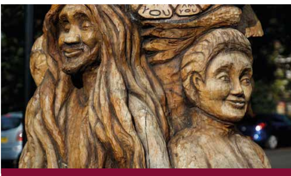
The I Am You Tree (mORGANICo) Peckham Rye

10 The Rye Pub Known over the years as Rye House, Rye Hotel and now simply The Rye, this is one of the many infamous pubs mentioned in The Ballad of Peckham Rye.