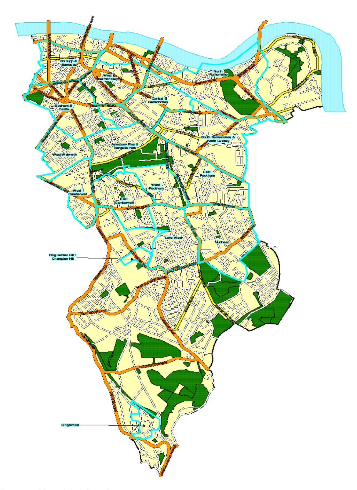
Figure 1 – Map of Southwark