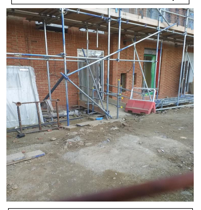
Work in progress for the temporary road