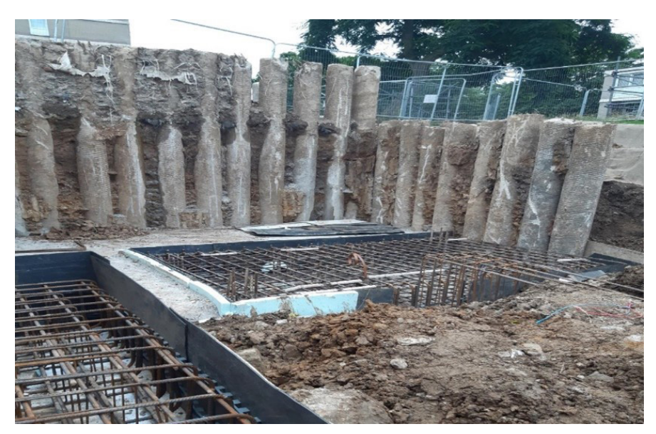
Steel reinforcements - Block B

ENGIE is working in partnership with Southwark Council to build new council homes at Rye Hill Park. The project is due to complete in summer 2022.