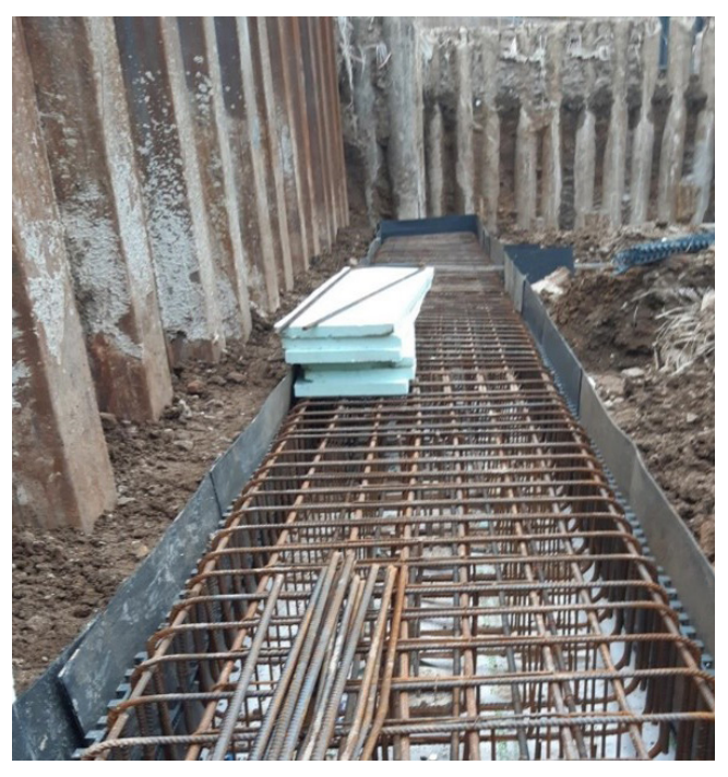
Steel reinforcements - Block B

As more businesses and venues start to re-open, we would like to remind you that we are still following guidelines regarding protective measures and social distancing to prevent the spread of COVID-19.