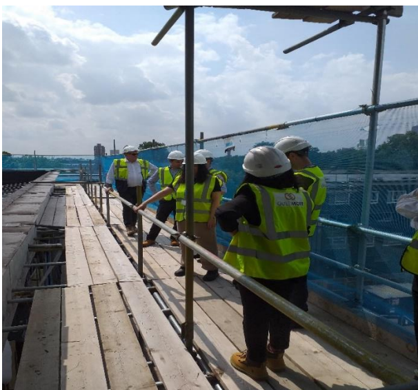
Cllrs and Guildmore inspecting roof