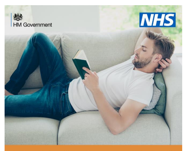
It is still a legal requirement to self-isolate if you are told to do so by NHS Test & Trace.

However is essential that we take these steps carefully and sensibly. It is expected and recommended people continue to wear face coverings in crowded places. You must still continue to self isolate if you are told to do so by NHS Test & Trace. Consider limiting close contact with people you do not live with.