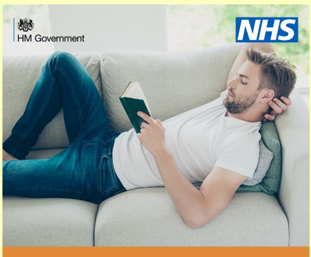
It is still a legal requirement to self-isolate if you are told to do so by NHS Test & Trace.

If you plan to travel do so safely and plan ahead. You should continue to wear a mask (unless exempt), wash hands and maintain social distancing when out in public.