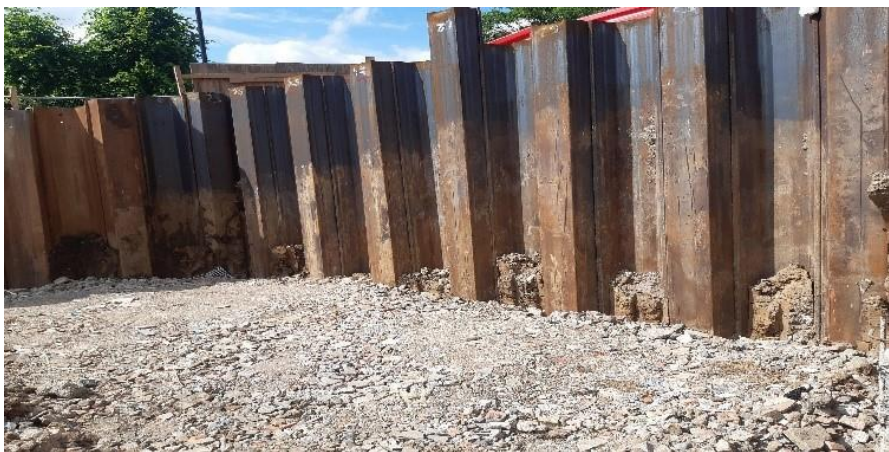
Sheet piling to existing retaining wall