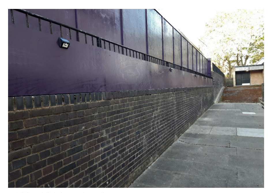
Additional lighting to hoarding

We will write to the residents of 2-31 Rye Hill Park separately and closer to the event, providing a full explanation of the works.