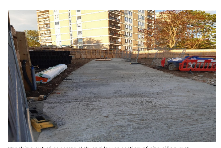
Breaking out of concrete slab and lower section of site piling mat

Over the coming weeks we will add a second layer of piling mat for the blocks. Drainage works outside the hoarding and adjacent to 2-32 Rye Hill Park will take place depending on Thames Water and their extended attendance schedule due to COVID-19.