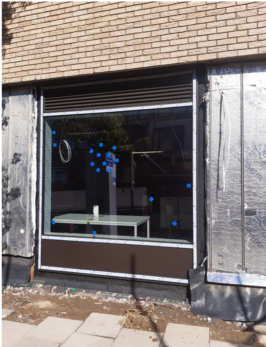
Curtain walling to the community centre - West Elevation

Working in partnership with Southwark Council, ENGIE is building new council homes at Meeting House Lane which are due to be completed by Summer 2021.