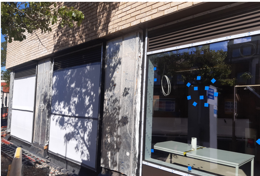
Curtain walling to the community centre - West Elevation

If you have any queries about the works being undertaken, please contact the site team using the details provided on page 1.