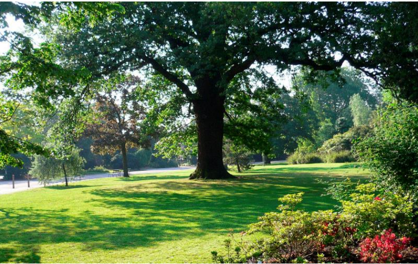
305,939 m2 hireable space

Power – 13 amp available in 2 locations Water – 3 water points Access - Direct road access from College Road, width restrictions apply Max weight limit 7.5 tonnes