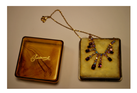
St John's Walworth CoE Primary School. Session at IWM