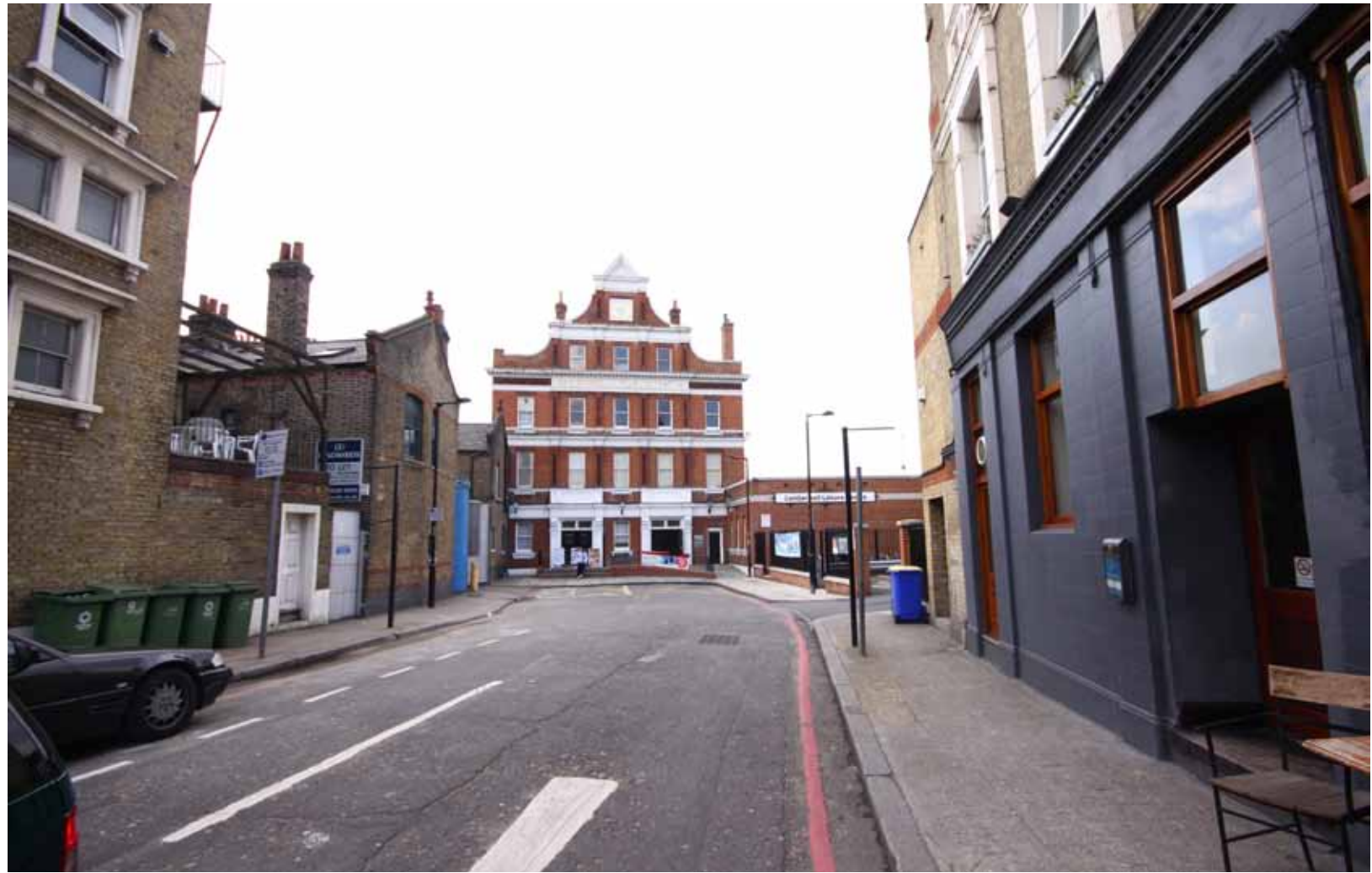
View towards leisure centre from corner of Camberwell Church Street

Once we have agreed the priority of improvements further design work will be commenced. There will be further opportunities to engage with us as this design process progresses.