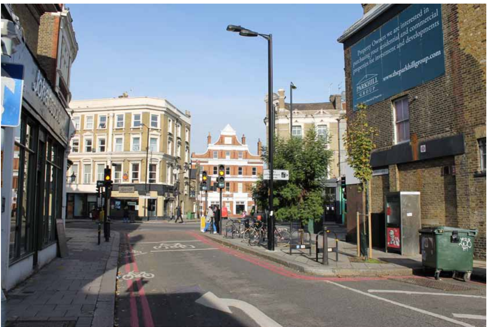
North towards Camberwell Church Street and the Camberwell leisure centre