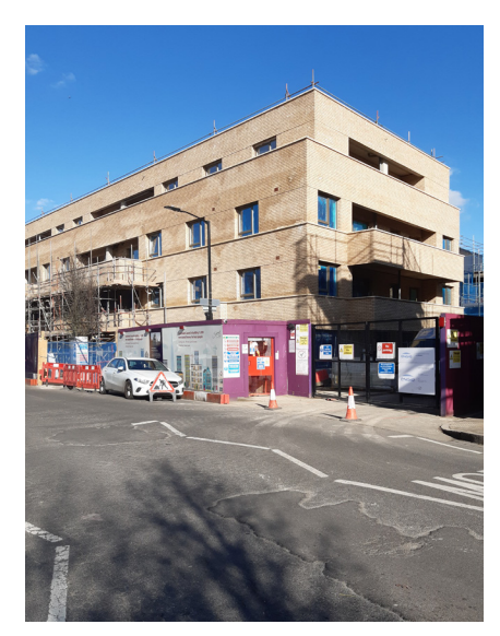
Scaffold removal - West elevation

ENGIE is also a multiaward winning considerate constructor and we pride ourselves on being an Associate Member of the Considerate Constructors Scheme (CCS) helping to improve the image of the construction industry.