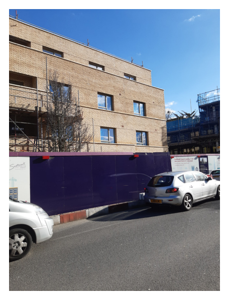
Scaffold removal - Northwest elevation