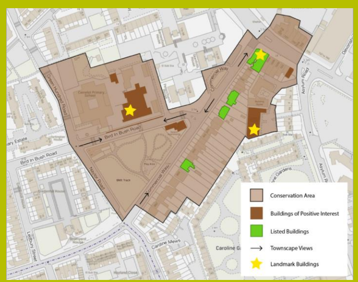
Kentish Drovers and Bird in Bush Conservation Area

At a meeting on 6 January 2021, the Planning Committee agreed to consult on five new conservation areas within the Old Kent Road area.