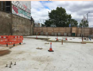
Ground floor slab cast