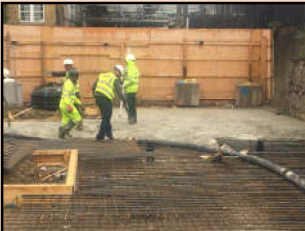
Mews House slab being poured