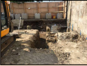
Piles being exposed ready for cutting down