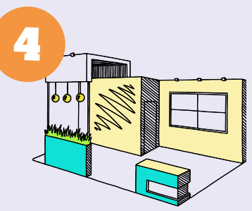
We help you turn your winning ideas into reality: a real time project, anywhere in one of our town centres or high streets