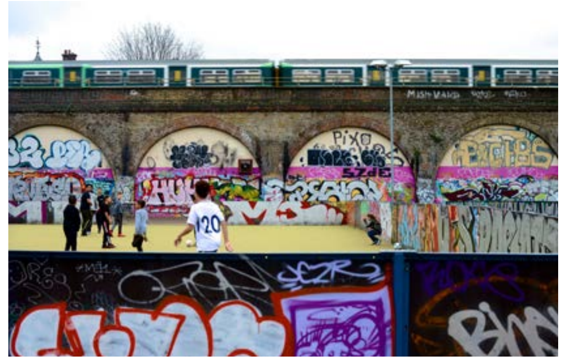
Sports pitches at Brimmington Park