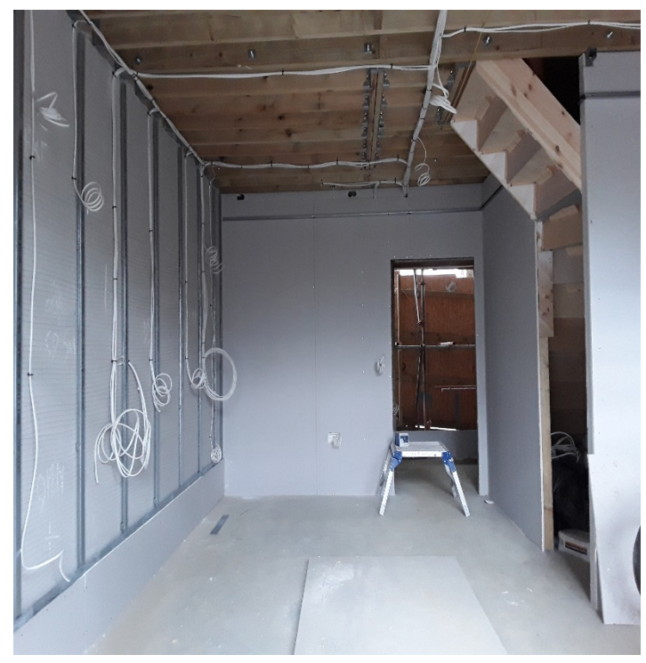
<u>Block B The Apartments</u> – Standing on the 2<sup>nd</sup> floor now the Metal walls are almost complete forming the apartments on Level 2.