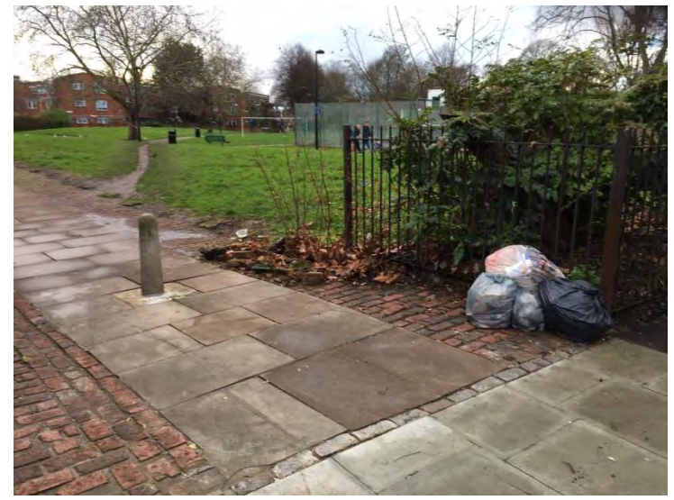
Above: Entrances on Woods Road are uninviting and attract fly tipping

The Master Plan aims to create better connections through the park, more welcoming entrances, improved planting and a new play area. Also a new nature area will transform a space that is currently inaccessible, making the park bigger.