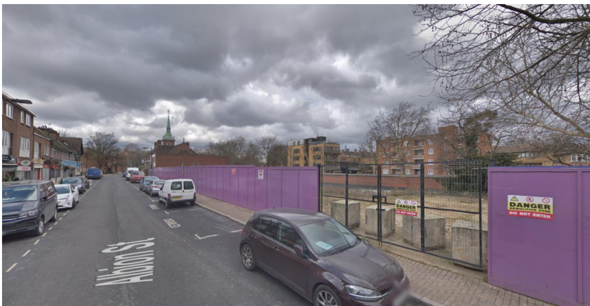
Albion Street hoarding

The Council knows that it will be Summer 2020 before works begin on site and they will take approximately 20 months to complete. The Council would like to make the site more engaging whilst designs are developed and the works are carried out.