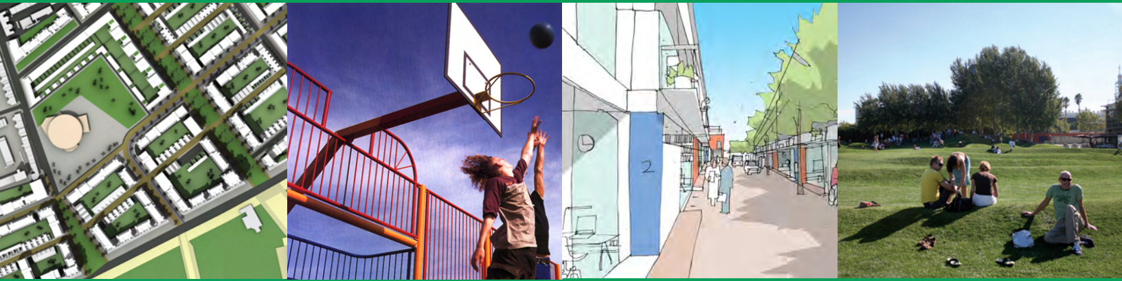
Table of Recommended Changes to Aylesbury Area Action Plan May 2009