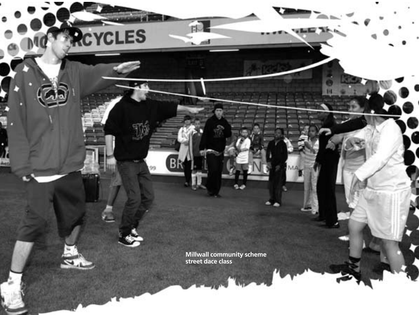
Millwall community scheme street dance class

local area at community council level and at Young Southwark executive meetings. YCC members are elected once a year through elections which young people across Southwark can get involved in.